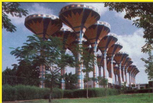
Suez Canal University